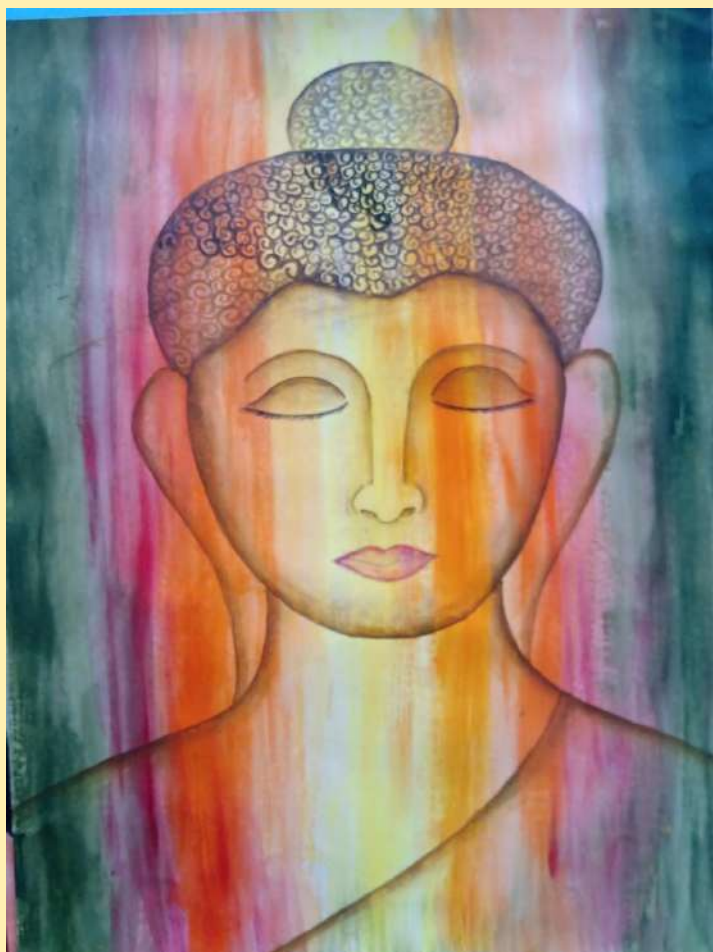
Chhavi Chandak - Class XII E