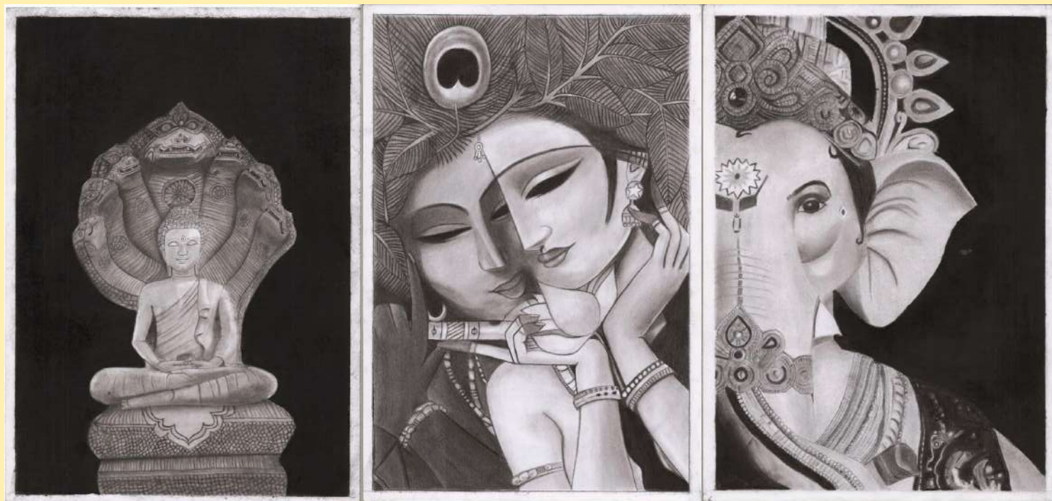
Raghav - Class IX E