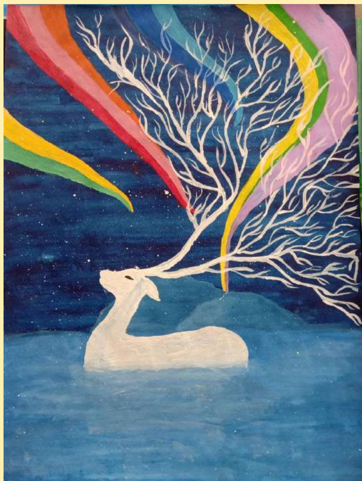
Payal Choudhary - Class XII F