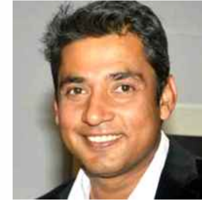
Pt. Shiv Kumar Sharma Padma Vibhushan International fame Sntoor Vadak

It was a great day spent at this great Institution. Its heartening to see that the school work to develop Kids holistically and not just academically. I wish the school All the best