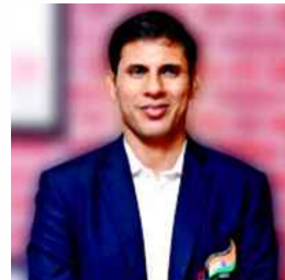
Pankaj Udhas Renowned Singer

I really enjoyed my visit to the school. There are many good players in the school. I pray/wish for the bright future of this school